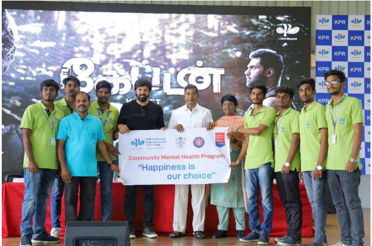
Avinashi Road Coimbatore - 641 407