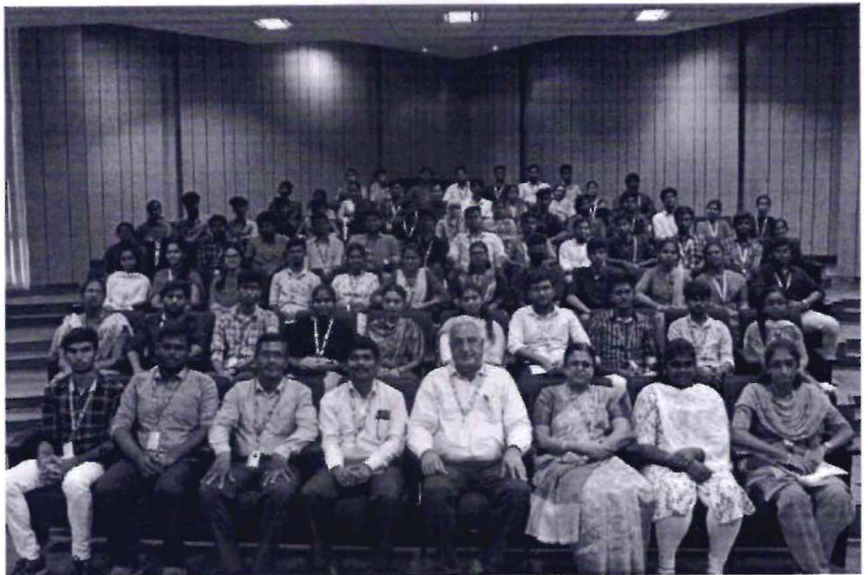
Awareness Programme - Gathering