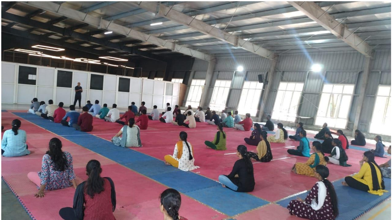
Yoga session at Rainbow Hall, KPRIET