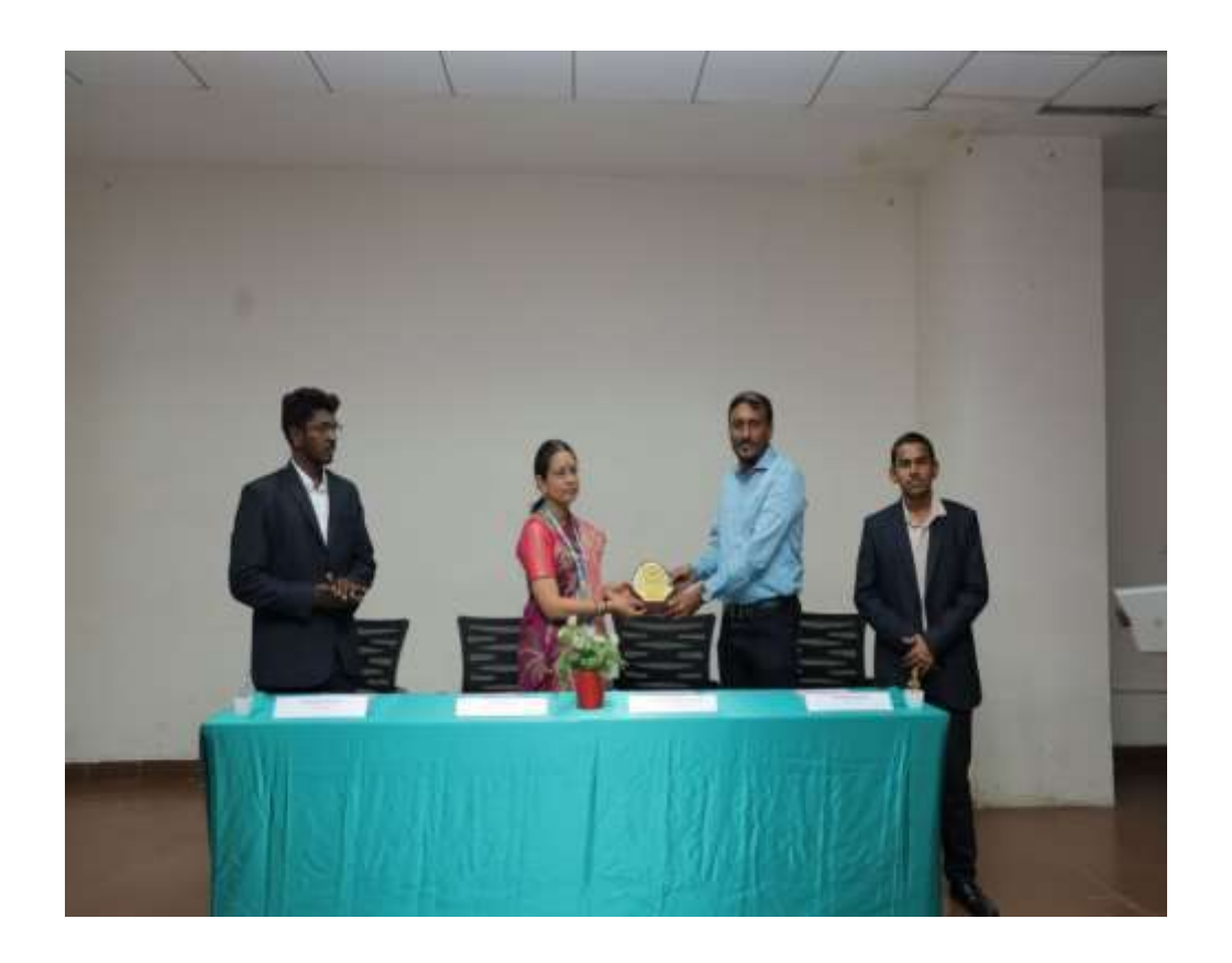
One Day Workshop on "Open Source Geospatial Solutions