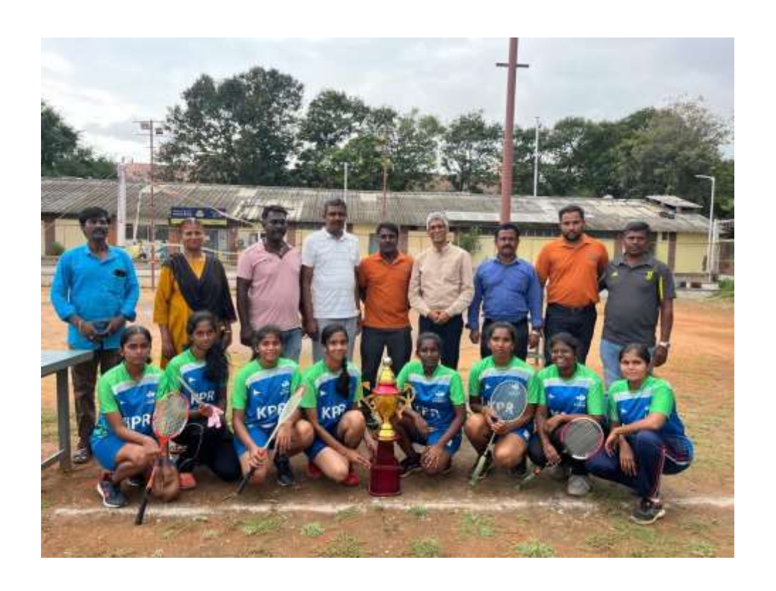
Anna University Women Ball Badminton Zone IX - I Prize