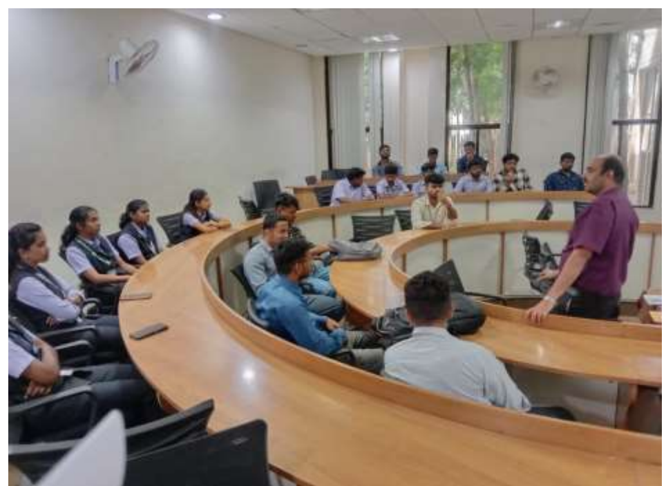
Expert Lecture on "Engineering to Business: How to get into the market"