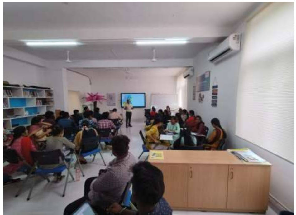
One Credit course on "Plan Approval and Tender Procedure"