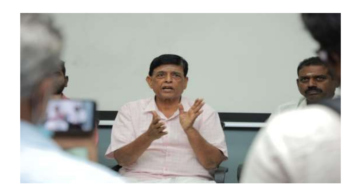
Expert Talk on "Climate of Africa"