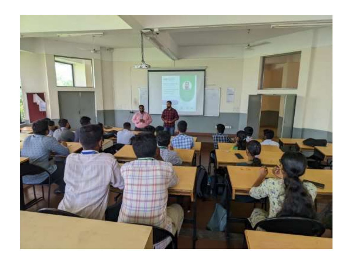
Invited Lecture on "Effect of lateral spreading and tunneling on adjacent foundations"