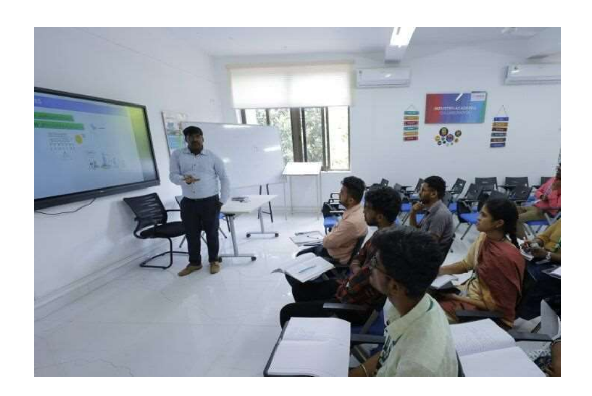
Alumni Lecture on "Bending the Basics: Understanding Shear and Bending Moments in Beams"