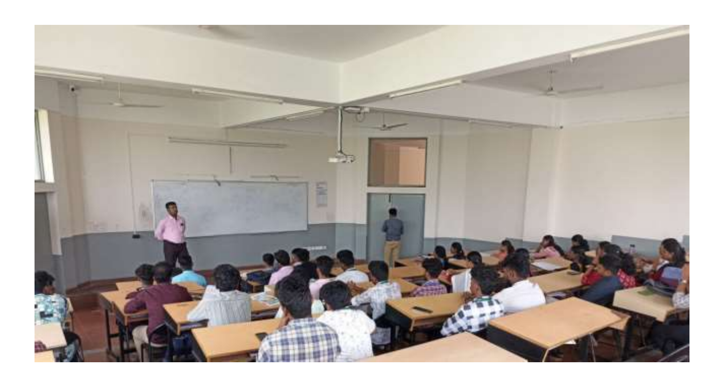
Invited Lecture on "Applications of Remote Sensing & GIS in Infrastructure Projects"