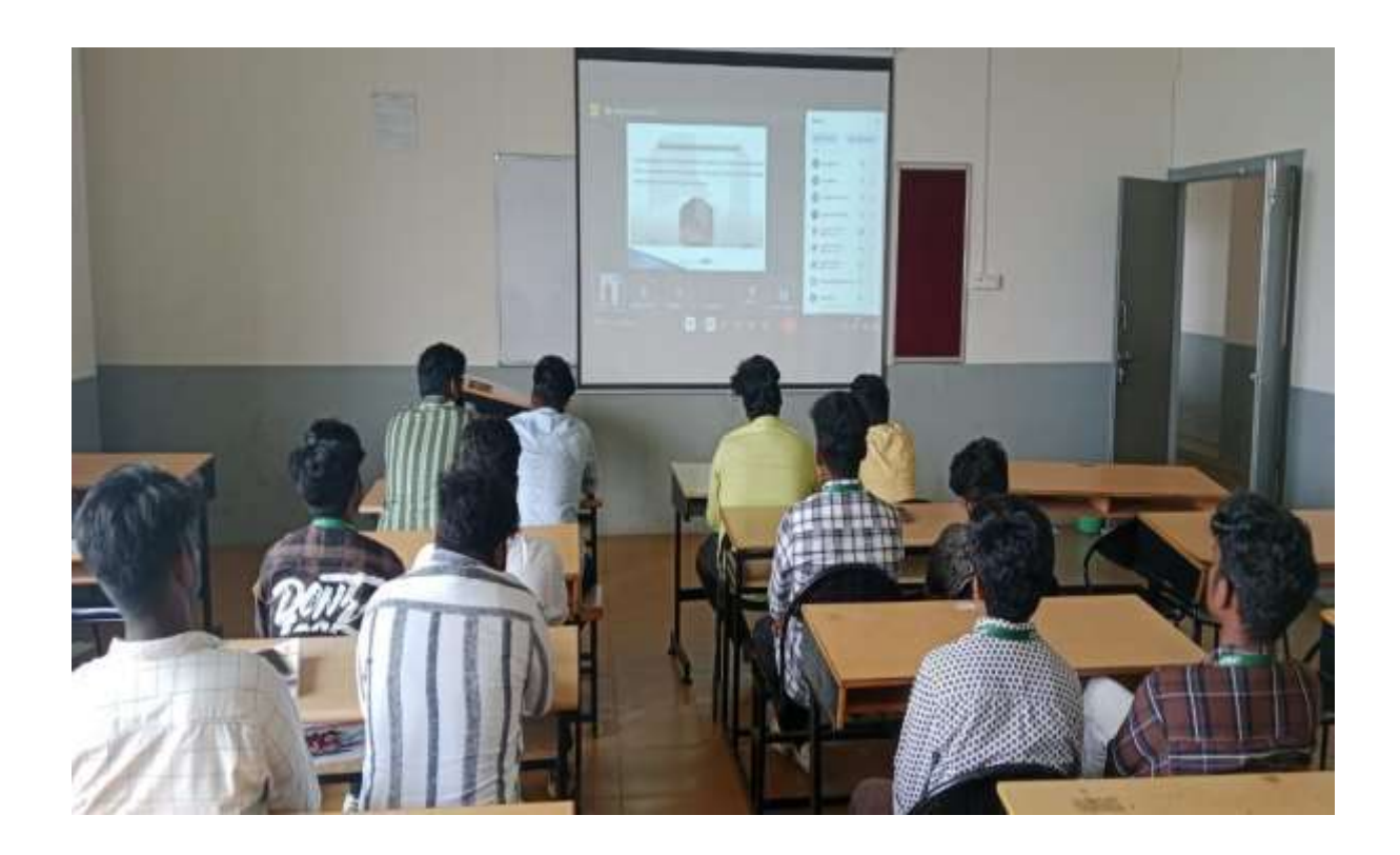
Alumni Lecture on "Career Opportunity for Civil Engineers in Defense Sector"