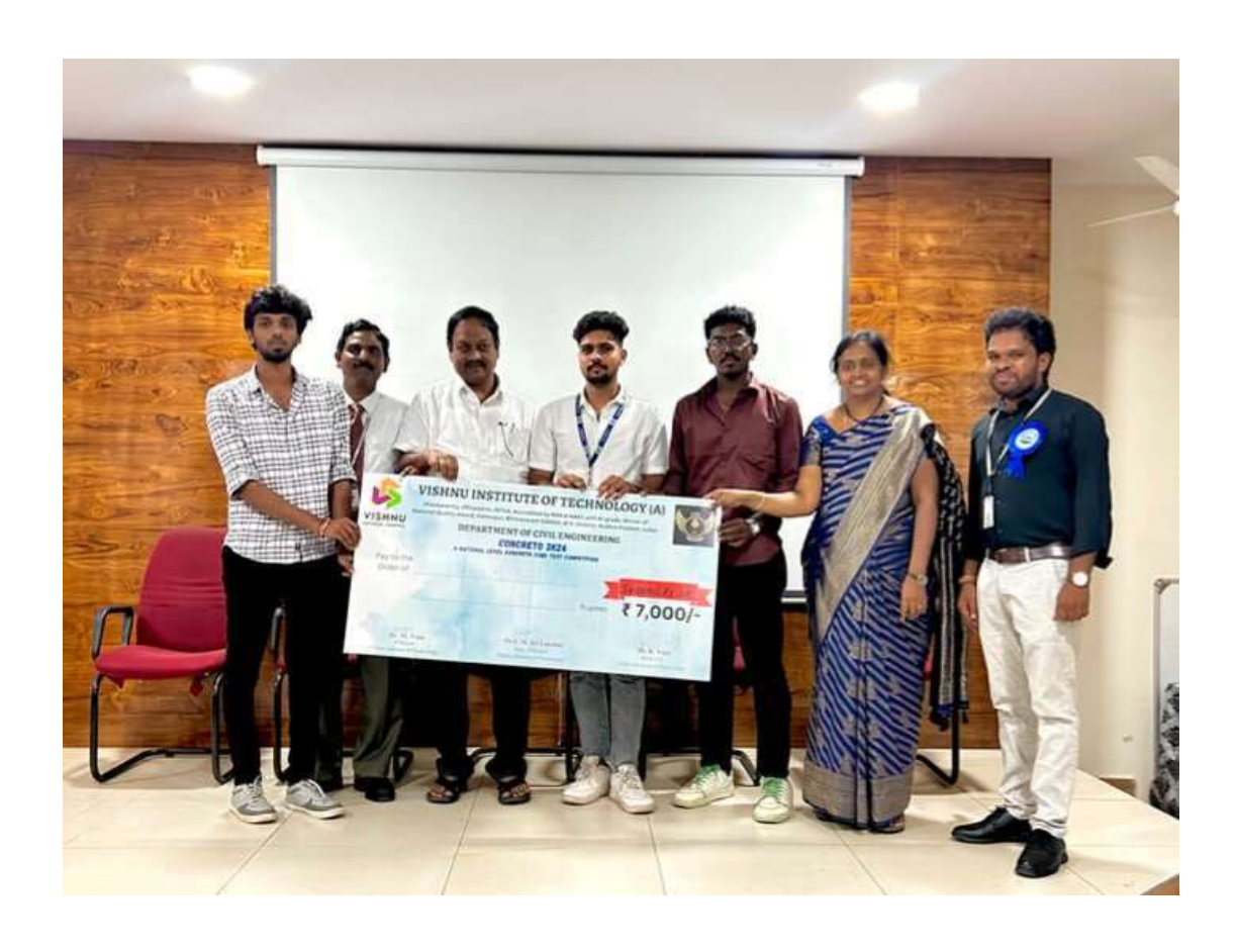
Concreto 2K24- Vishnu Institute of Technology